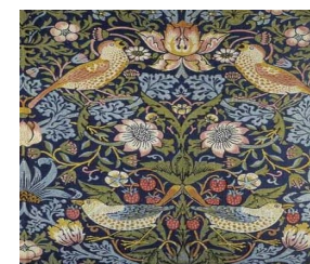
Strawberry Thief by William Morris