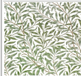
Willow Bough by William Morris