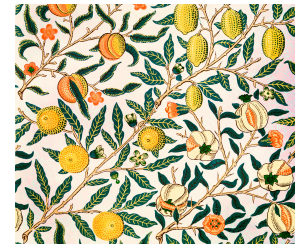
Fruit by William Morris